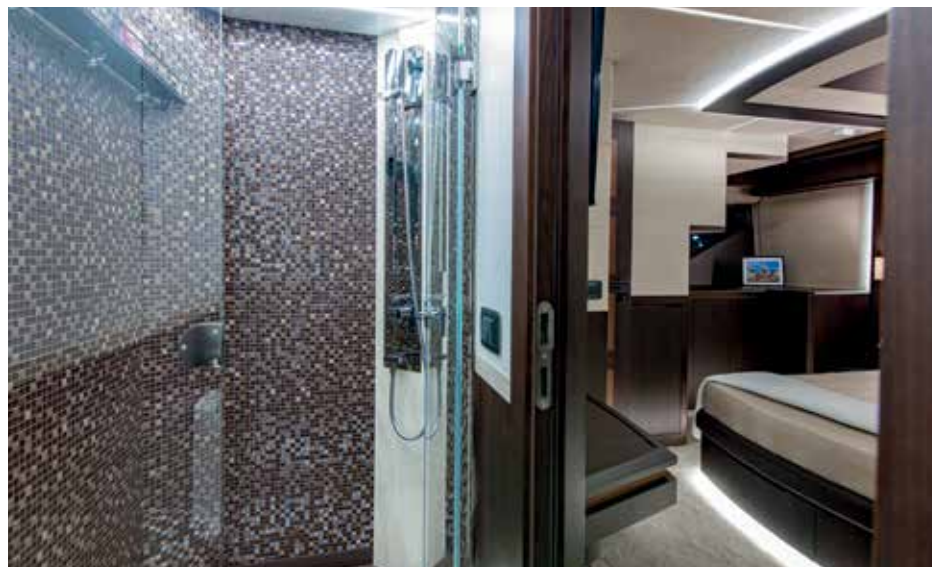
Above: Mosaic tiling in the owner's ensuite is yet another appealing decorative finish.

Above: Powerful contemporary lines with transformational solutions for exterior and internal spaces make the Galeon 640 Fly a potent competitor in its segment.