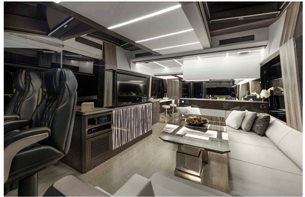
A large TV in front of the entertainment area —