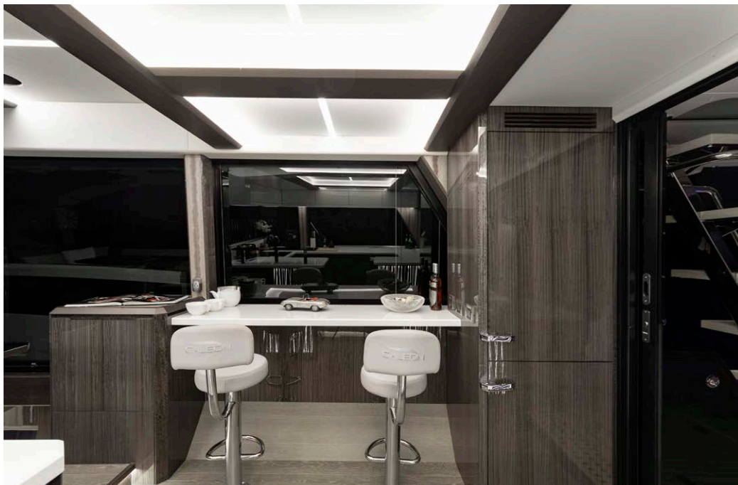
Slide the window and serve drinks to the outside area! —