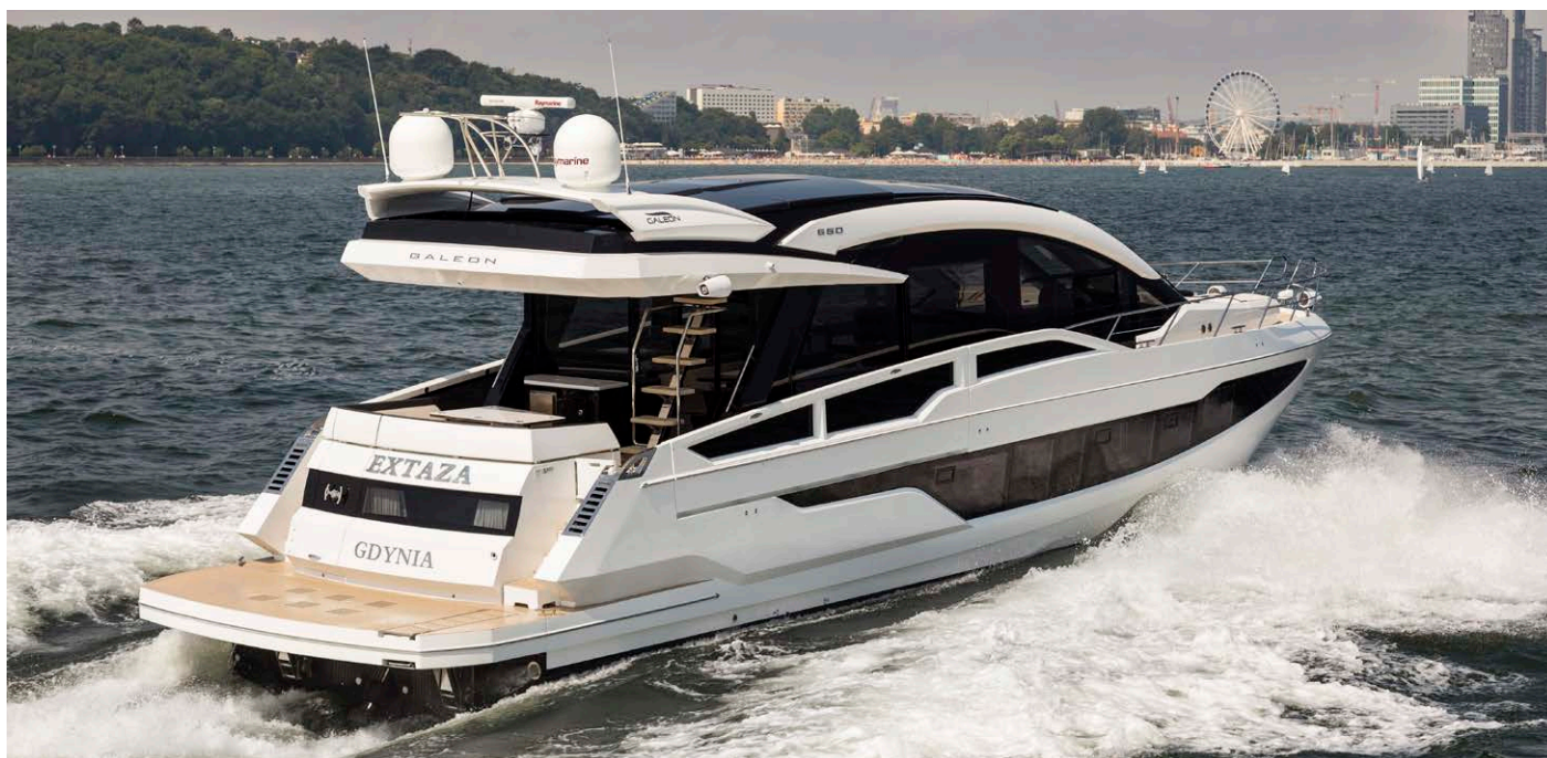
Simply close off the roof and the SKYDECK becomes a hardtop - brilliant! —