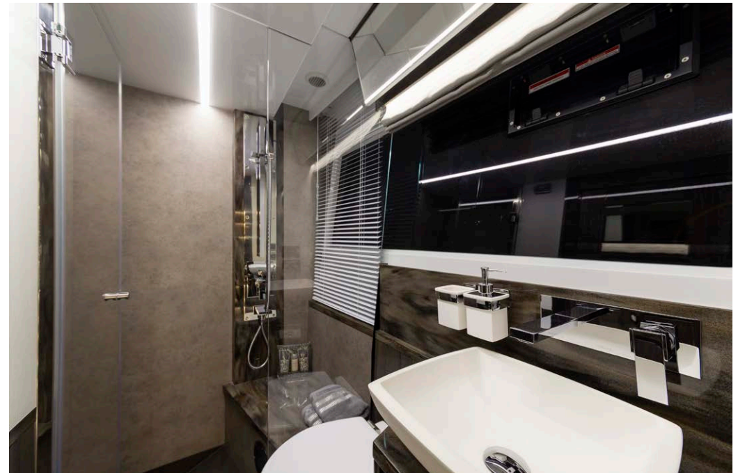
Large windows can be found in all cabins and bathrooms