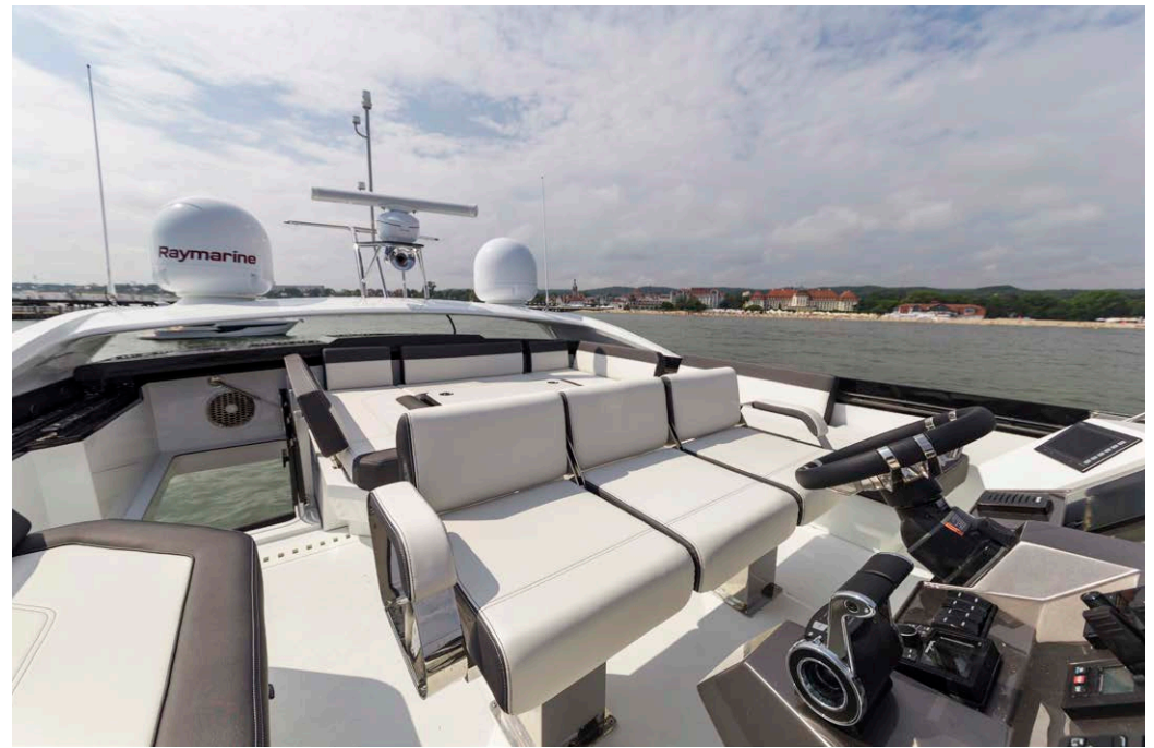
— The whole top deck can be quickly closed off by a carbon roof - genius!