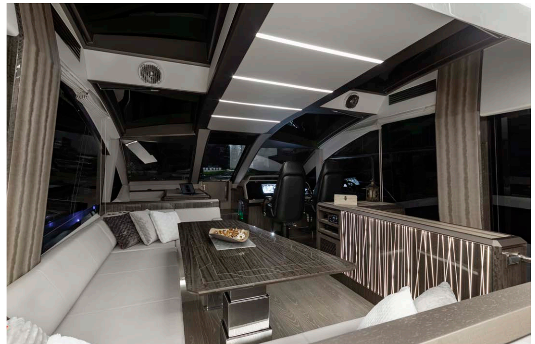
Notice the incredible amount of windows all around —