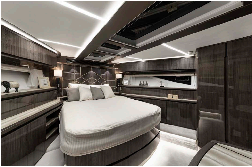
Forward VIP cabin with separate access and private bathroom