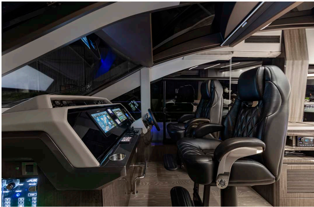
Two sport seats occupy the helm area —