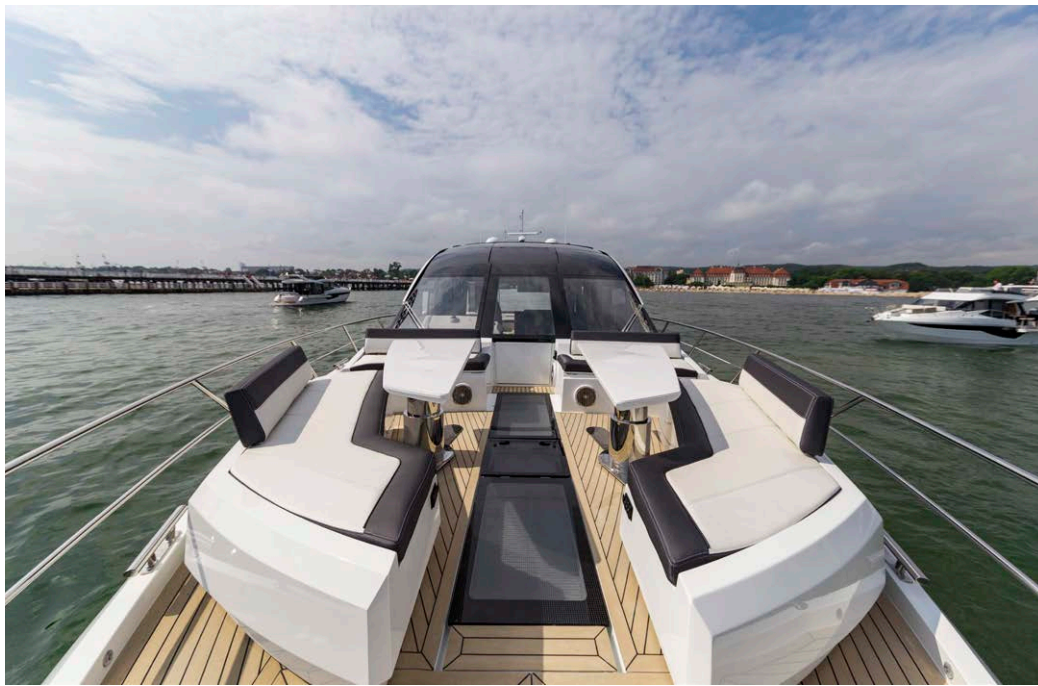
— Both tables and seats slide out to create a bow leisure area