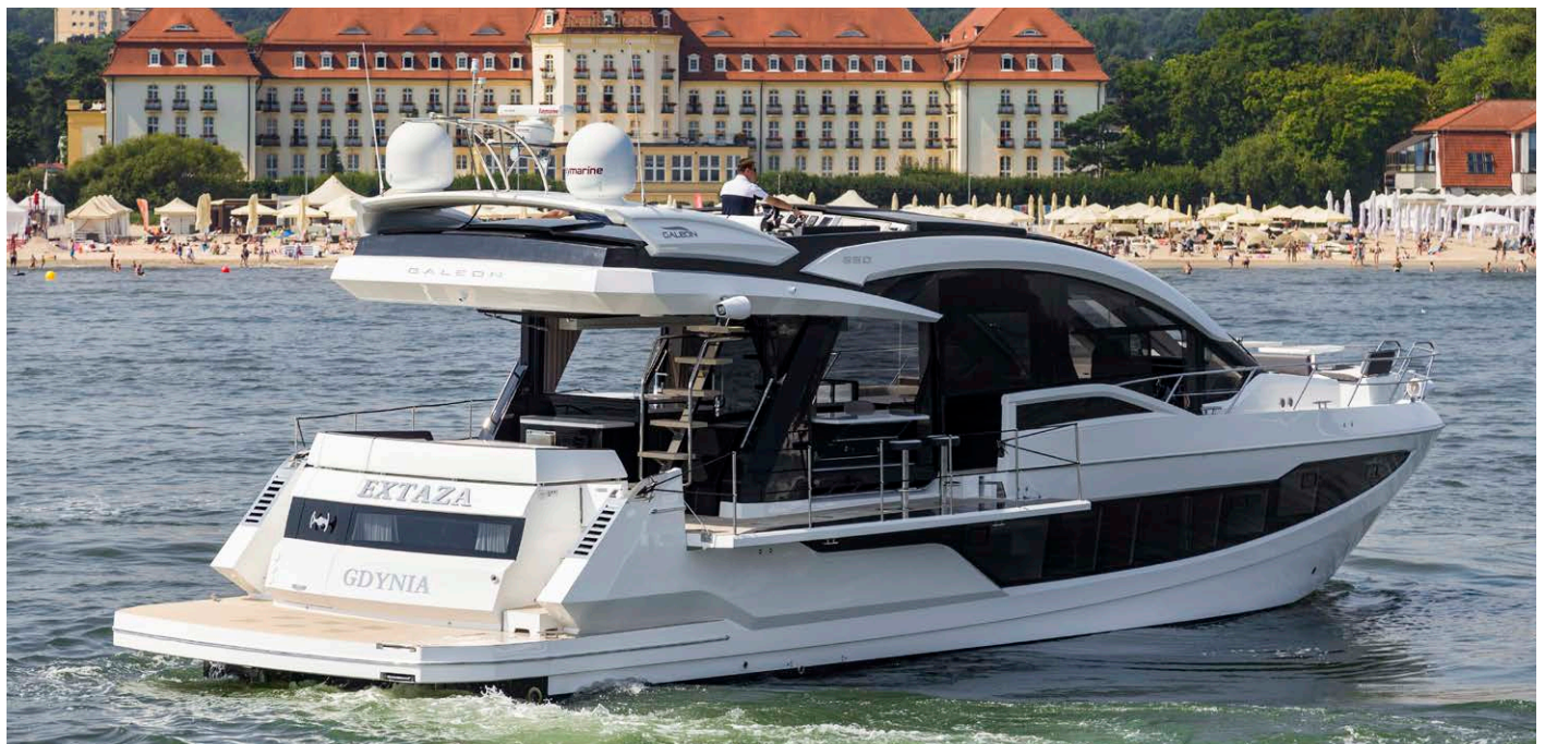
A hydraulic platform with access to the crew cabin