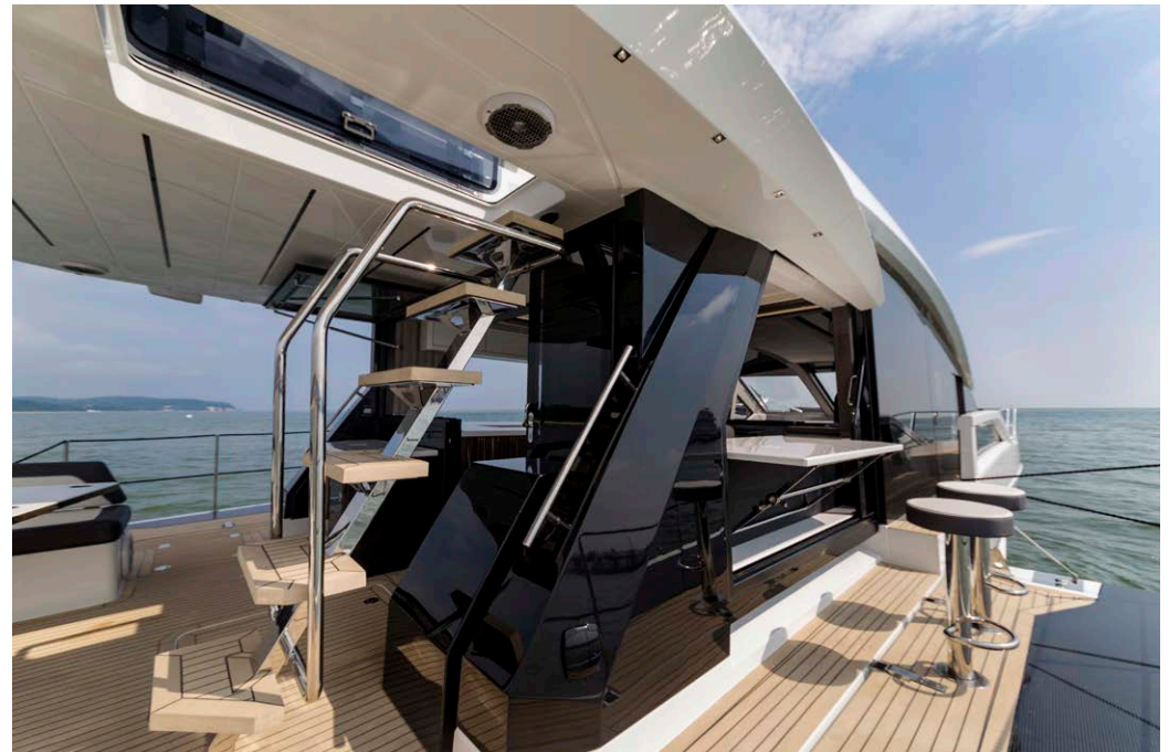
— Guests can enjoy both the port and starboard side bars