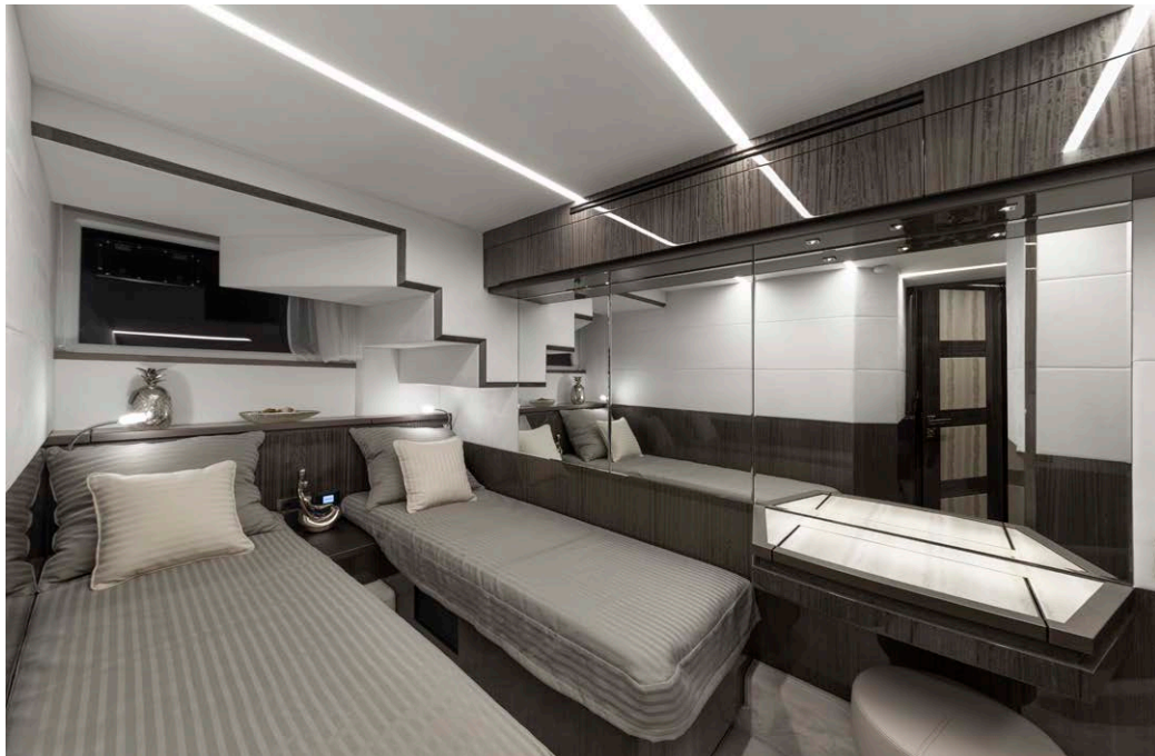
Twin beds in the guest cabin