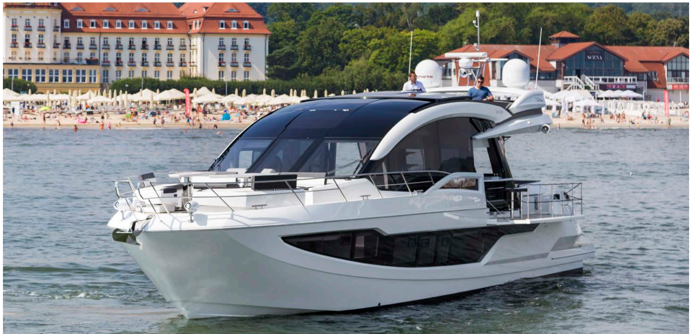
The middle panel of the windscreen retracts providing easy access to the bow