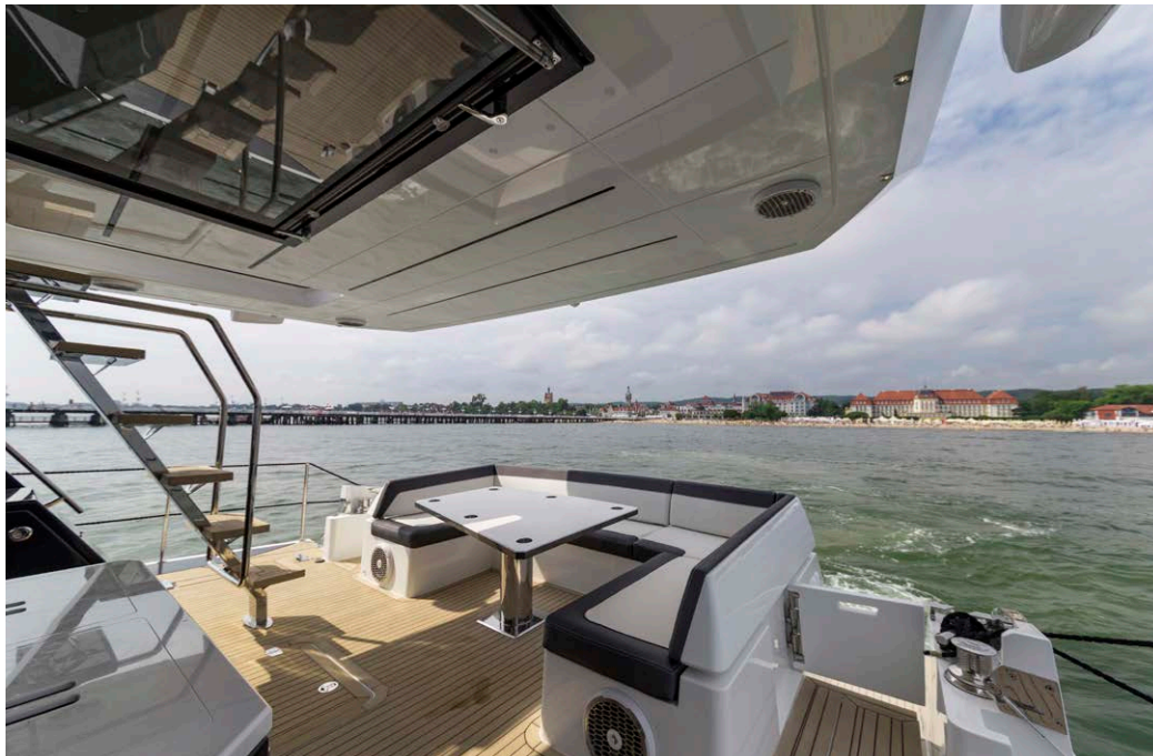
— Plenty of space in the cockpit for all activities