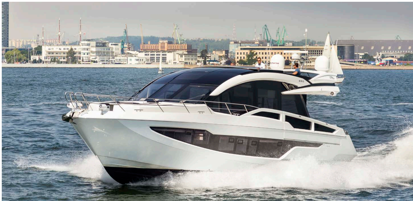
Supreme handling and performance —