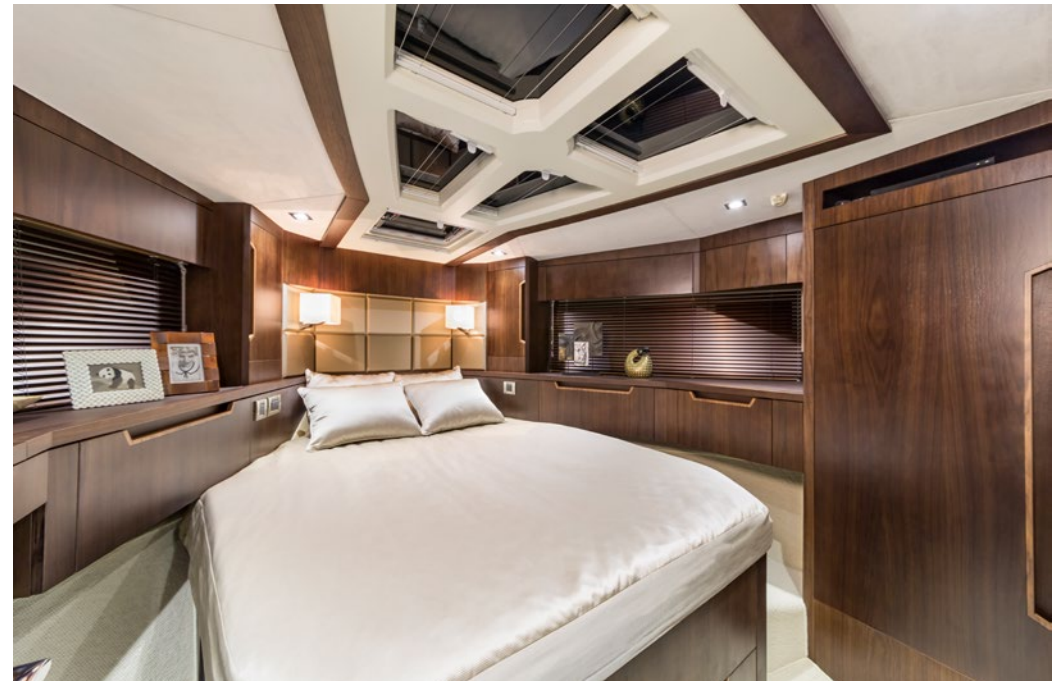
Forward VIP guest cabin with bathroom access —