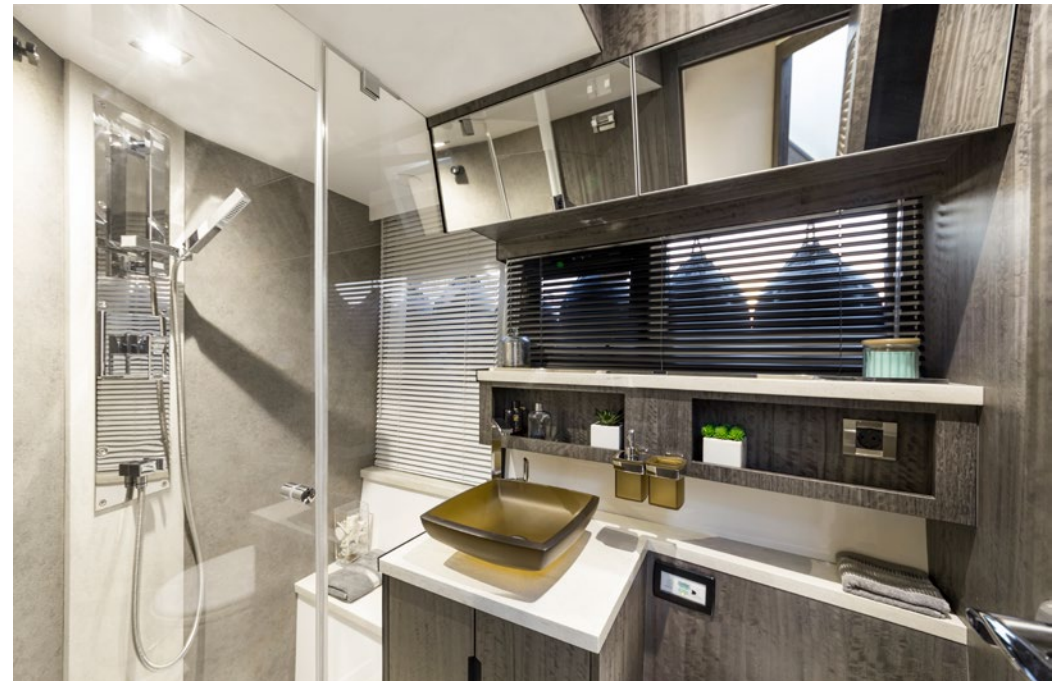
High quality fixtures in both batrooms