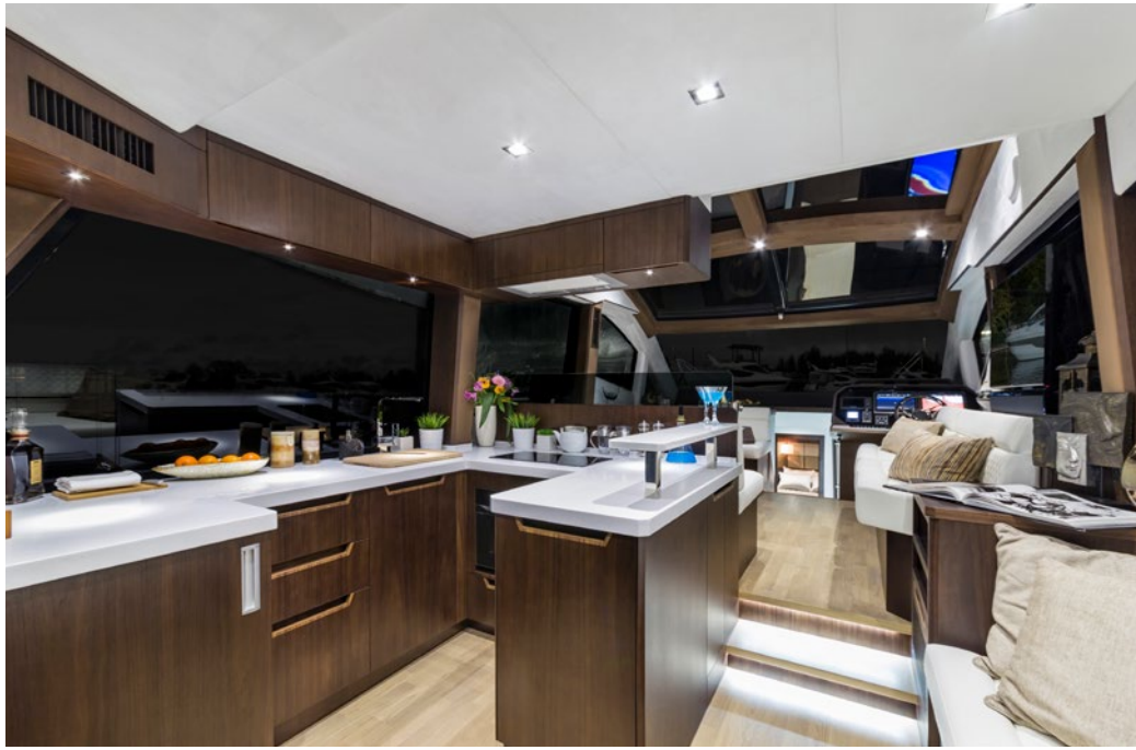
A full-sized galley —