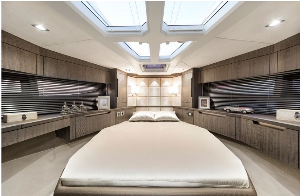
Forward VIP cabin with plenty of storage