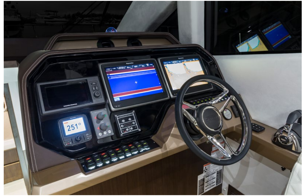
Helm station gives total command of the yacht —