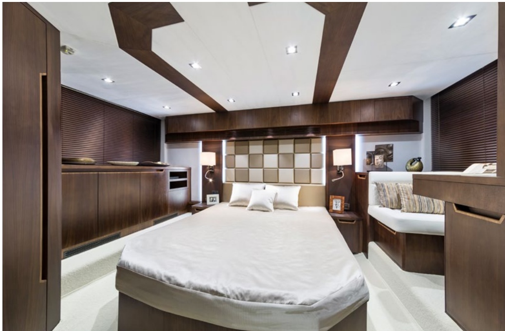
Owner's cabin with standing height all around —