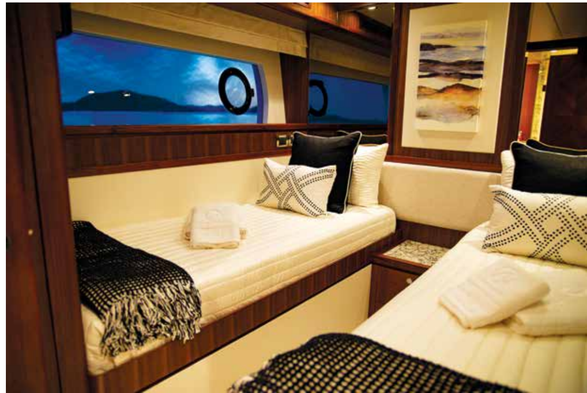
CLOCKWISE FROM- FROM ABOVE Our author could not fault the quality of the OAB88's finish; On-location in The Whitsunday's; Even the smallest detail oozes luxury and comfort

The power plants are set atop unidirectional carbon fibre capped stringers. Noticeably smooth, the twin 1600hp MTU 10V engines have plenty of torque propelling the 88 to cruise speed quickly. Installed with plenty of working space around them and mounted in a well laid out, impeccably finished and expertly soundproofed engine room. All of this results in the most important feature on the unnoticed list — a lack of vibration and noise.