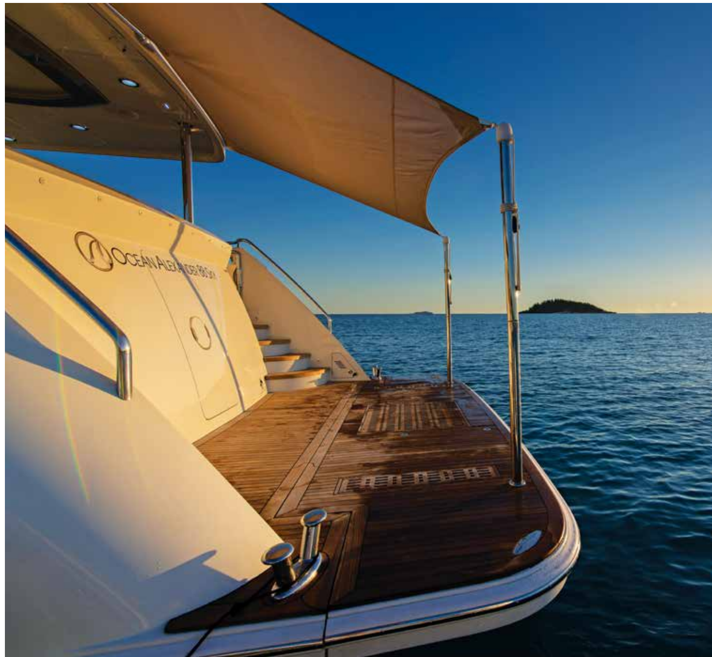
CLOCKWISE FROM BELOW An awning adds appeal to the already large swim platform; the cockpit lounge is well protected from the elements also; formal dining with a priceless view

Once the Divergence 45 is tied up alongside, stepping aboard the 88 Skylounge I am greeted by the crew who were the consummate hosts for my time aboard. Whereas we might typically spend an afternoon reviewing a boat, I am fortunate enough to be staying overnight. Rather than the supposition of flow and functionality of a vessel, I am getting to experience it completely,