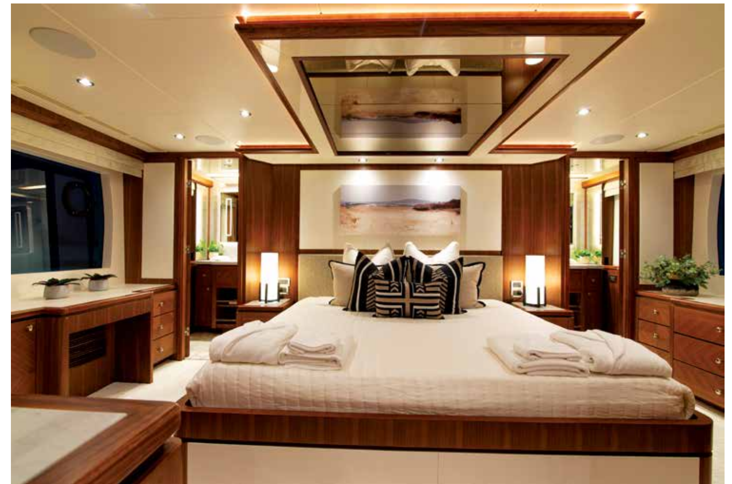
TOP DOWN The full-beam master suite will appeal to the most discerning owner; a classic marble finish in the ensuite adds brightness while highlighting the exquisite woodwork in the vanity