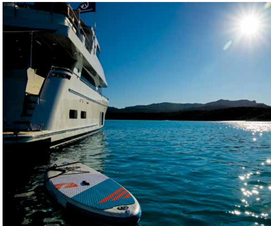
CLOCKWISE FROM ABOVE With a massive range, any idyllic location is in reach; the jacuzzi commands the best view on board; the OA88 with her sister vessel for our trip, the OA45 Divergence