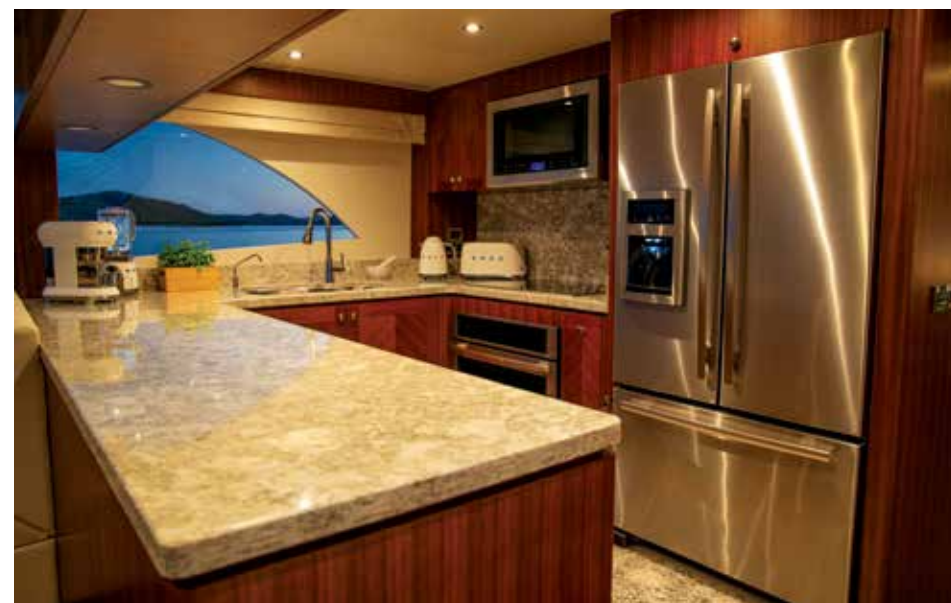
CLOCKWISE FROM ABOVE The bridge deck will appeal to party-goers; step inside the bridge and a semi-formal lounge awaits anyone looking for respite from the outdoors; the helm is a study of simplistic elegance; the galley, although not the biggest, is well appointed and laid out

helm chairs have excellent forward views, and Ocean Alexander's treatment of the dash is stylish and sophisticated. The Multi-function screens are housed in a slim freestanding pod supported by three stainless posts, through which the hard wiring runs. It resembles a modern multi-screen video editing suite rather than a built-in moulded helm station.